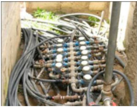
Simplified so-called “spaghetti” Multiple connections.