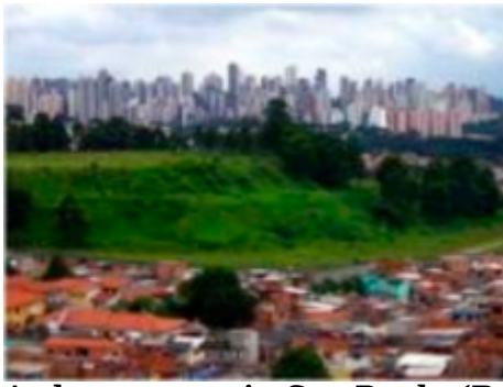
A shanty town in Sao Paulo (Brazil).

city or neighbourhood for the technical, social and economic conditions of neighbouring locations may vary considerably and this does not make it any easier to find solutions to these problems. They cover differing realities as they range from squalid informal and unrecognised suburban areas to very poor ones with high population densities right in the centre of town.