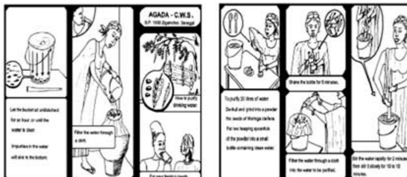
Document for making villagers aware of the use of the moringa olifeira in treating water