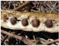
Moringa seeds.