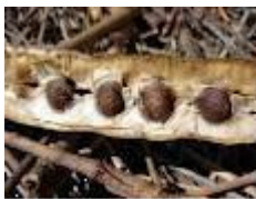
Moringa seeds. PDF Photo Bank