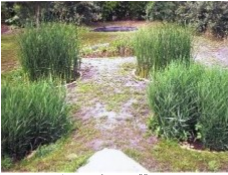
Succession of small constructed wetland treatment ponds