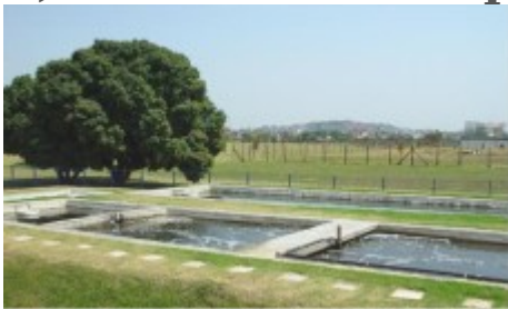
Small stabilisation ponds

Stabilisation ponds involve passing wastewater at a very low flow rate through a series of sealed ponds large enough to ensure that the water remains there for several days or even weeks.