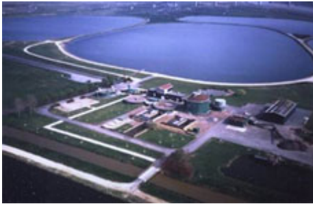
Stabilisation pond treatment station of the town of Rochefort (France), one of the largest

If the land on which the pond is to be built is permeable, it has to be waterproofed with a coating of clay, compacted soil or impermeable material to prevent infiltration.