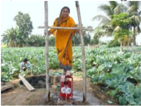
Treadle pump in Maharashtra (India).