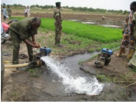
Irrigating market-gardens in Benin using a motor pump.

Refer to Factsheet E40 "The motor pumps" .