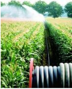
Spray irrigation