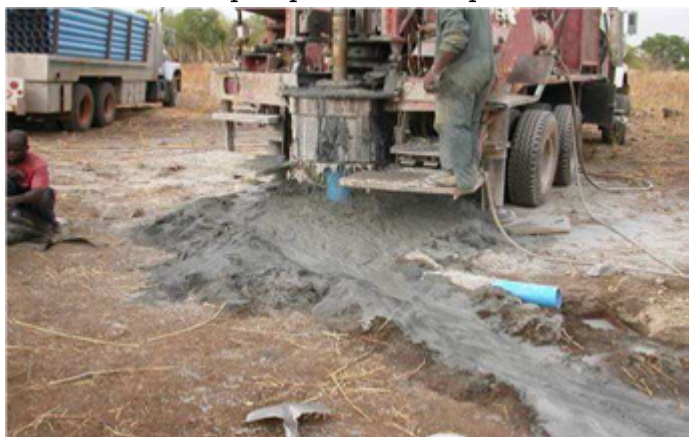
Drilling a well in Togo

- These drilling methods are often mounted on large, well-equipped lorries . They use rotary drilling tools that chew or break the rocks or firstly, if the soil is soft as is often the case when drilling commences, large augurs . The boreholes can be several hundred metres deep. A pump is often installed at the bottom to pump the water up to the surface.