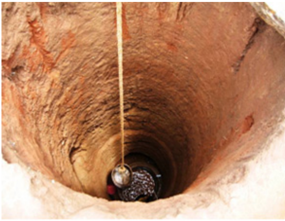
Digging a well manually in Madagascar .