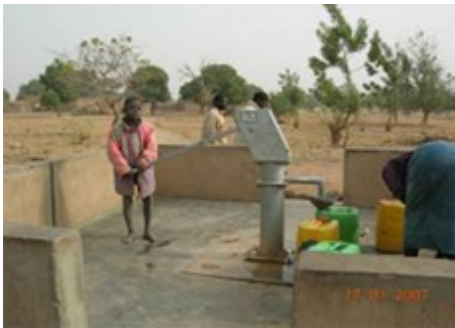
Drilled well in BURKINA FASO