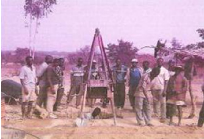
Digging a well Region of Savanes in Togo

Less rustic mechanical digging resources can also be used to reduce the considerable physical effort. Dug wells are not very deep (between 10 and 20 m usually, 30 to 40 m exceptionally). As they are fairly shallow, they risk being contaminated and can dry up more easily than the other types of well.