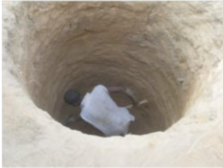
Digging a large sump in Mali.