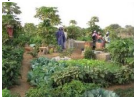
Creation of vegetable crops in Mali.