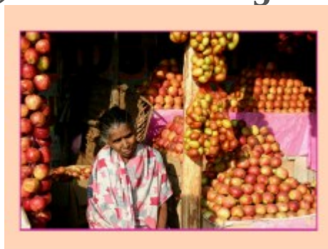
Opening of a fruit shop in India