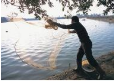
Launching of a small fishing activity

When the loan payment arrives, the internet user can chose either to be repaid, or reinvest the money in another project.