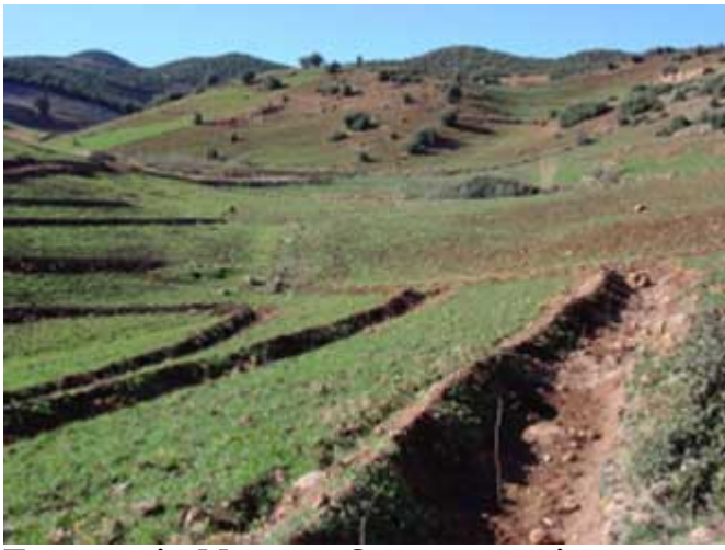
Terraces in Morocco