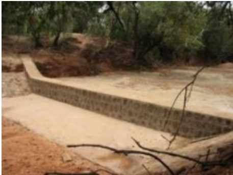
Sand dam Photo Sanddam

A sand dam is a small dam that is constructed most often in a seasonal or intermittent water course. It has the effect of causing sand to accumulate upstream from the dam. The sand can have as much as 40% water in it depending on the size of the dam, which is serious reserve.