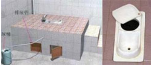
Indoor Ecosan latrine in China.