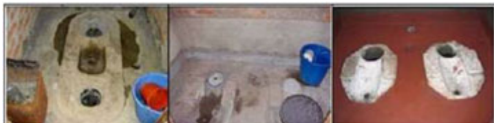
ECOSAN latrine models used in Nepal.

- finally, other, more elaborate, models have a third hole in the slab to allow anal cleaning after use, the water used for this purpose being collected into a specific container.