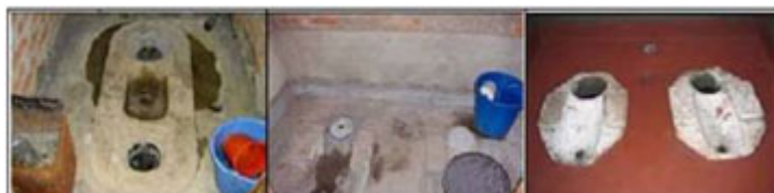
ECOSAN latrine models used in Nepal.