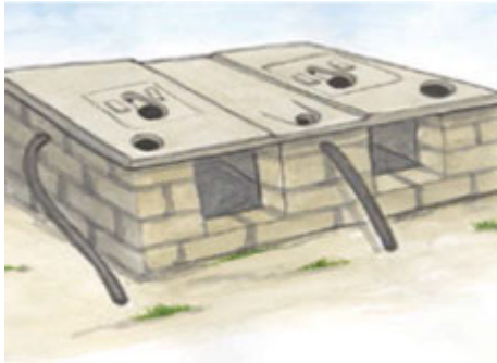
Illustration by WEDC