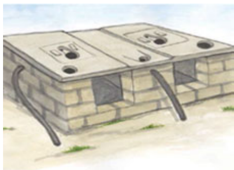
Illustration by WEDC